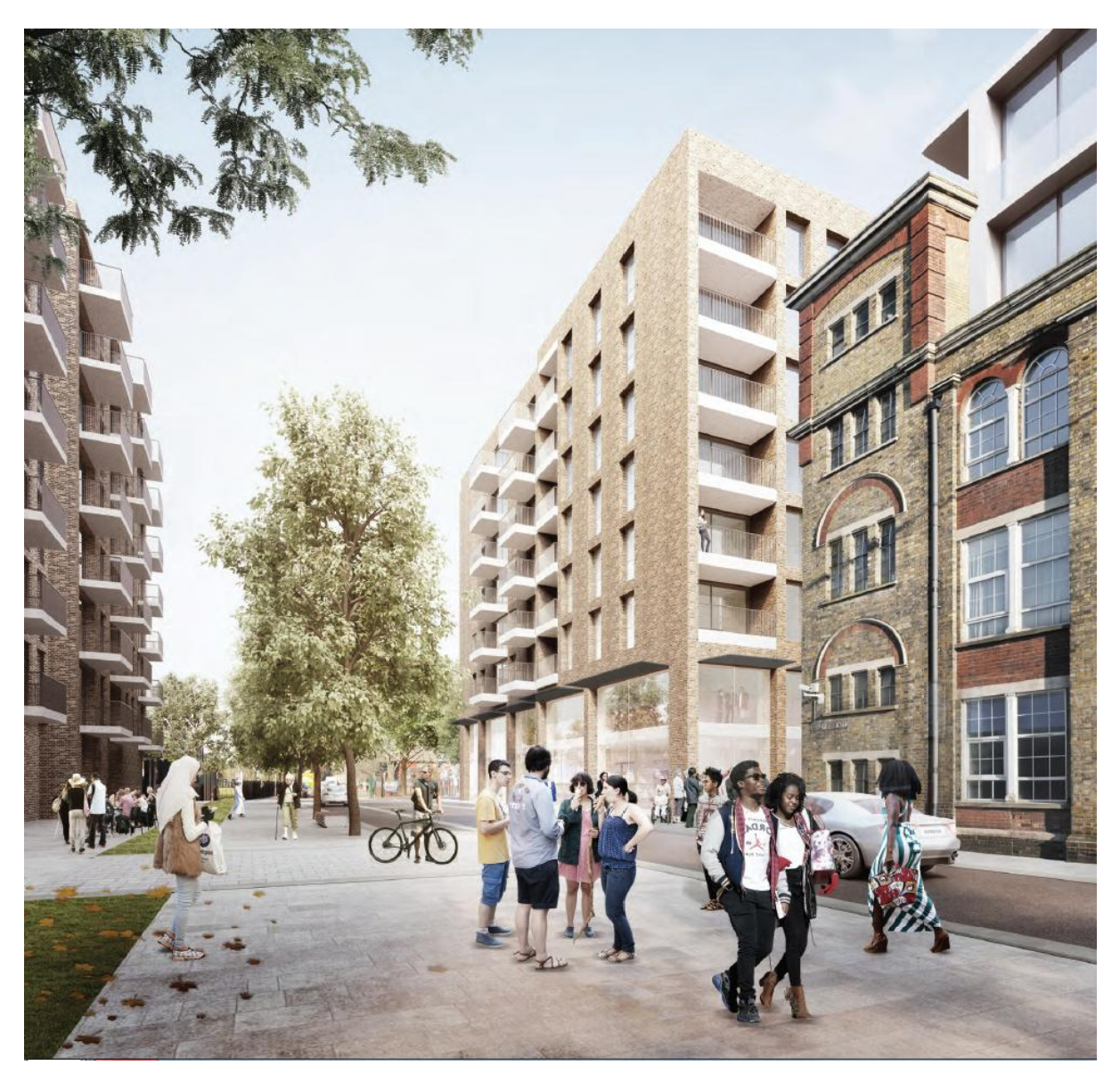
Illustrative visualisation looking north along Ashley Way