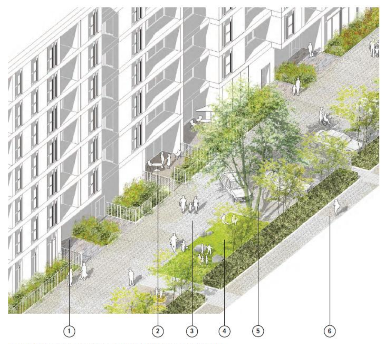
Cannon Factory and Ashley House Illustrative Axonometric: Ashley Link